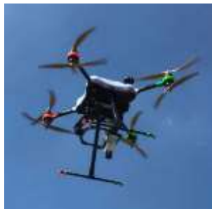
FirefLEYE 185 mounted on a UAS